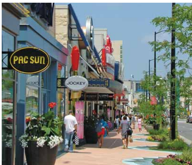
Shop 'til you drop at Atlantic City Outlets - The Walk, where new stores are on the way.

Square. Inside, shopping and dining present a decidedly international flair: Tourneau, Gucci, Burberry, Tiffany & Co., Hugo Boss, Louis Vuitton, Armani A/X, Bebe, Buddakan, rumjungle, English is Italian, Dubliners and Phillips Seafood among them. Even romantics get a place of their own at The Atlantic Club, Atlantic City's first wedding chapel, where glass walls offer views of the ocean and beach, and live webcasting enables friends and family anywhere in the world to watch the ceremony.