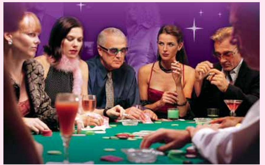
If you're hot for poker, Atlantic City is the place to get your game on.