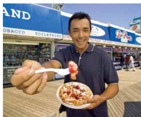
A world of casual dining awaits you with fine restaurants and "Boardwalk food" stands along the famed Atlantic City Boardwalk.

bistro fare with your freshly brewed latte. Also new at Resorts Atlantic City is Gallagher's Steakhouse, the New York City classic.