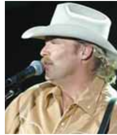
Headliners of all sorts, including country music's Alan Jackson, thrill capacity crowds at Boardwalk Hall.

Swing to the sound of Big Bad Voodoo Daddy at Trump Marina on April 29 or watch one duck a swing on June 10 when Antonio "The Magic Man" Tarver takes on Bernard "The Executioner" Hopkins at Boardwalk Hall.