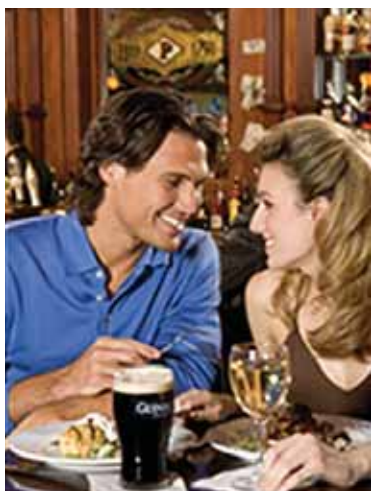
Find a world of dining experiences at The Quarter at Tropicana.

For outdoor dining in the summer months, try Back Bay Ale House and the Flying Cloud Café, both at Gardner's Basin, the Wonder Bar on the inland waterway, or one of the al fresco restaurants along the Boardwalk. And if it's a simple sandwich you crave, be sure to stop at White House Sub Shop. The line will be long, but it moves swiftly and there's a Wall of Fame, showcasing photos of famous patrons like Frank Sinatra, Susan Sarandon and George Clooney, to entertain you while you wait.