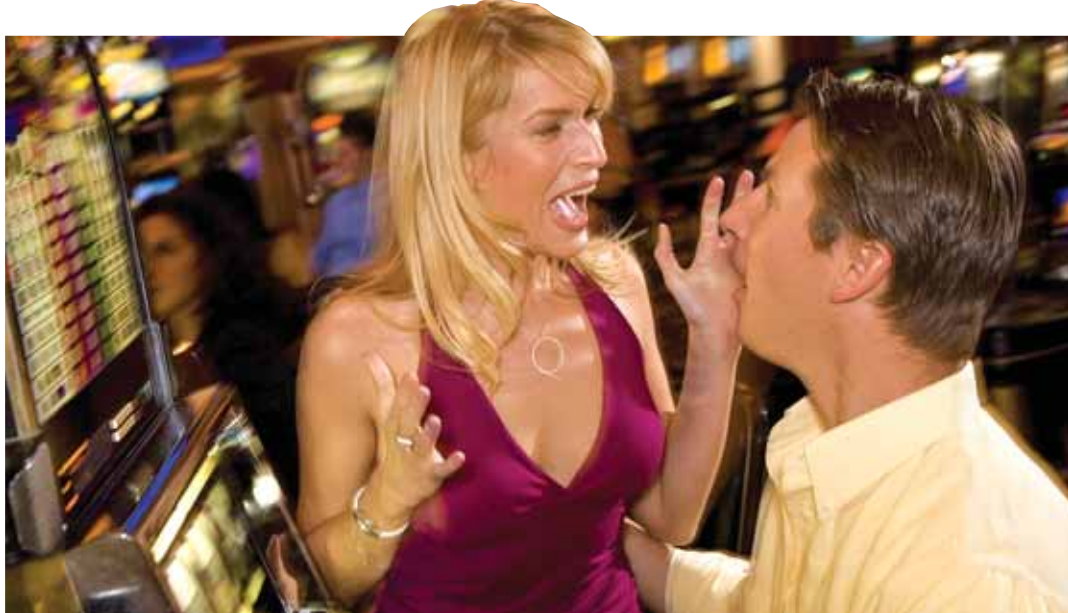
Atlantic City's Trump casinos sizzle with excitement.