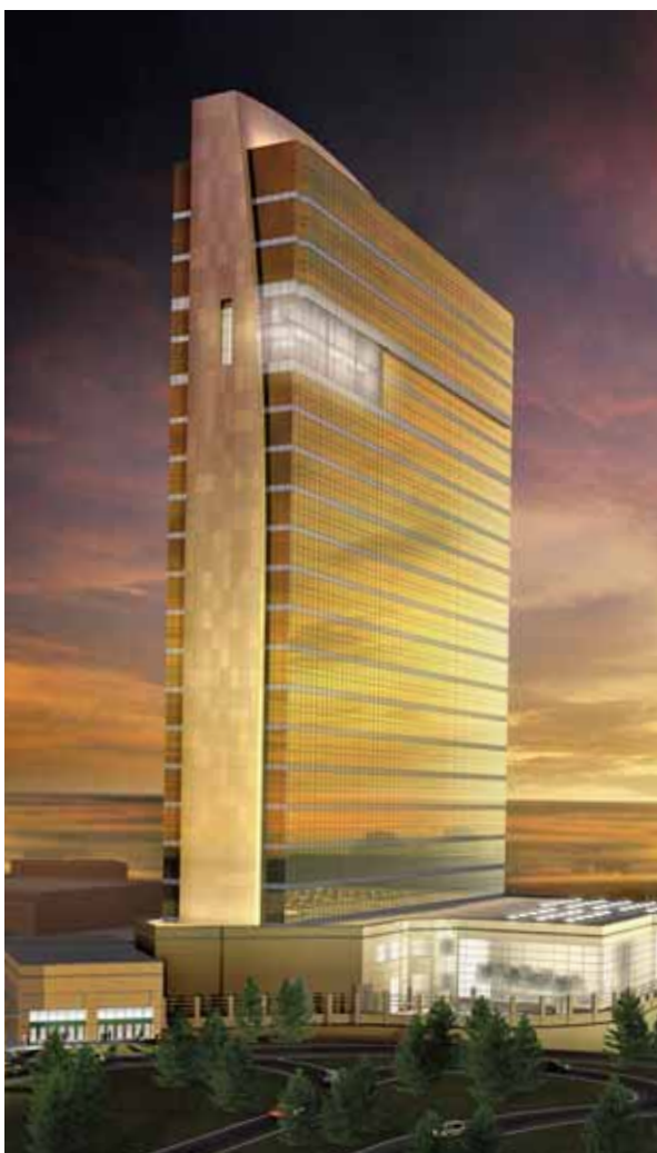
The newest Borgata babe, The Water Club, is one of three new hotel towers coming to Atlantic City. Watch for the other two at Trump Taj Mahal and Harrah's.

In the works and scheduled for debut in late 2007 is the latest Borgata babe, The Water Club at Borgata, a $325 million hotel tower that will put a new spin on the definition of sexy surroundings. Named for its views of the Atlantic Ocean and the bay, and the quartet of pools it will feature (including two outdoor pools that will remain open year-round), The Water Club will satisfy high consumer demand for an upscale hotel experience with its 800 guest rooms and suites, a two-story,