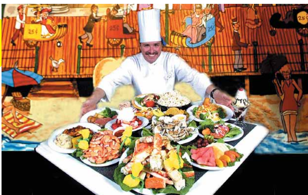
Dining in Atlantic City is an event you won't soon forget.

From the City of Brotherly Love comes chef Stephen Starr with two of his mega-hits, Buddakan and The Continental. At the first, patrons dine on Asian cuisine at communal tables under the watchful eye of a 10-foot Buddha, and at the latter, discerning palates