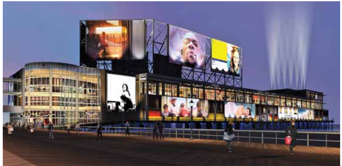
Expect all the flash and excitement of Times Square, and all the shopping luxury of Park Avenue, when The Pier at Caesars opens on the Atlantic City Boardwalk later this year.