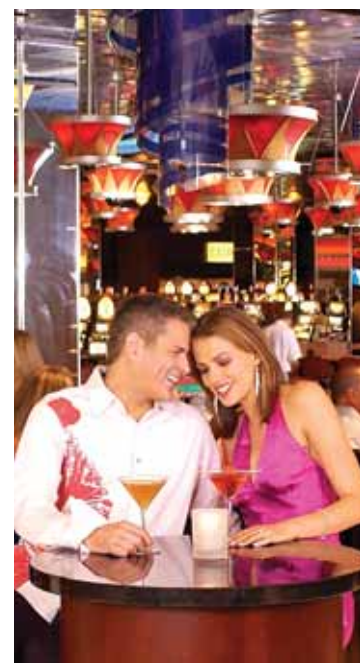
Have fun 25/7 at Resorts' new 25 Hours Bar, one of many new hot spots in the city.

Whether it's Elvis Costello, May 19, at Trump Taj Mahal Casino Resort, the non-stop list of entertainment at House of Blues, the Temptations at Tropicana Casino Resort or Andre Rieu with the Johann Strauss Orchestra at Board-