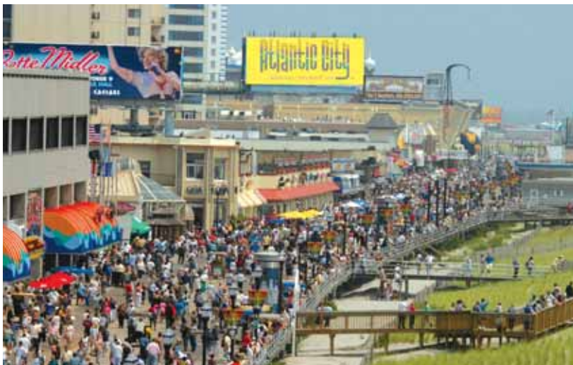
Atlantic City's beach and Boardwalk attract thousands of visitors on busy summer days. Many of the Boardwalk stores will get a makeover in the next year.