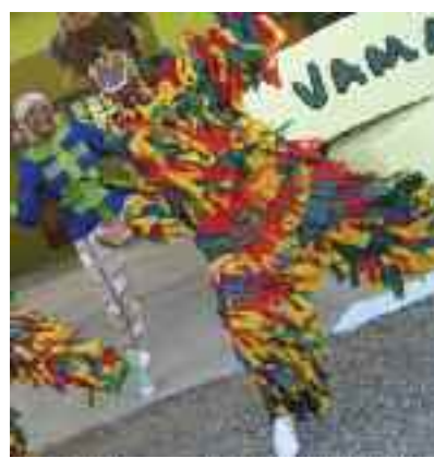
Experience the history of Jamaican culture at Outameni

For sheer excitement, check out the huge roster of tours offered by Jamaica Tours . Wonderfully diverse, they include: horseback riding on the beach; ATV tours; plantation visits; canopy tours; Jungle River tubing; a Black River