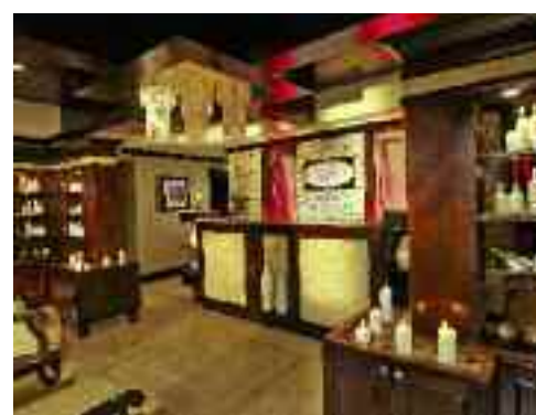
Indulge yourself at the Red Lane® Spa at Sandals Whitehouse in the South Coast

In Ocho Rios: KiYara Spa at Jamaica Inn is nestled on the cliffs of Cutlass Bay, reflecting the tranquility of its lush surroundings. Visit www.jamaicainn.com .