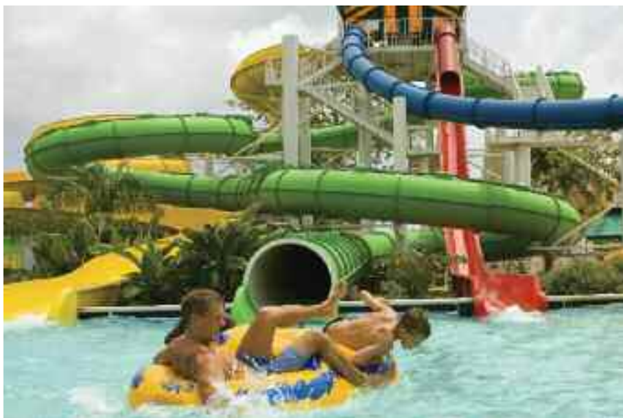
Cool off at Negril's new Kool Runnings Waterpark

even after-hours babysitting so parents can dance beneath starry skies into the wee small hours. Guests of all ages can take advantage of the many daily activities, including the resort's Circus Workshop, karaoke competitions and trivia contests. Rates start at just US$99 per adult, per night, and $50 per child (aged 2 - 12 years), per night. Visit www.starfishtrawl.com .