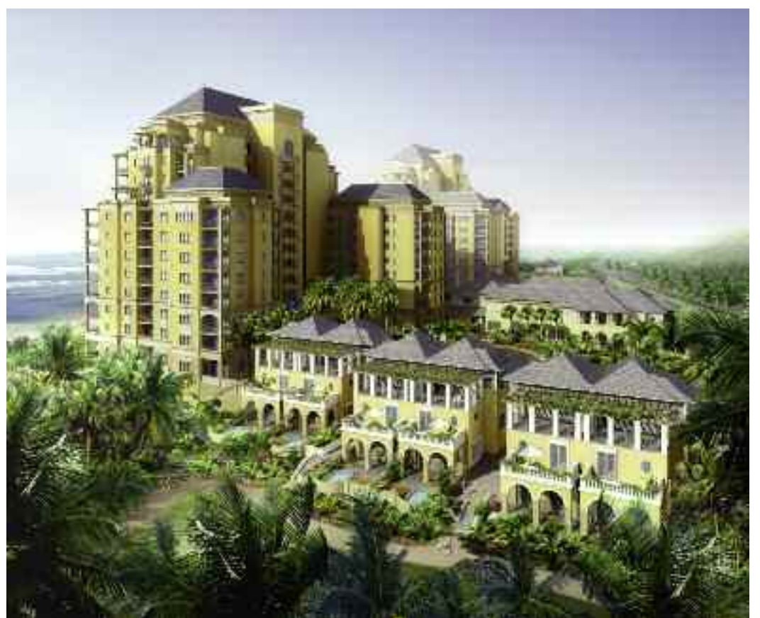
Artistic rendering of The Palmyra Resort & Spa in Rose Hall, Montego Bay

JAMAICA TOURS LTD. is the leading ground tour operator in Jamaica. With a great fleet ranging from private Lincoln Town cars to 51-seater motor coaches, and talented, knowledgeable guides, we offer: deluxe excursions and guided tours to Jamaica's finest attractions; airport meet-and-greet service; return airport transfers; guest assistance in all resort areas; and private limousine service. Visit www.jamaicatoursltd.com .