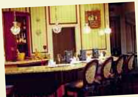
The exclusive C-Bar at Royal Plantation

BEACHES RESORTS , the Luxury Included™ Family Vacation, debuts two new offerings for teens and tweens: an all-new Pirate's Island Waterpark at Beaches Boscobel featuring 10 exhilarating slides, and the Caribbean's only teen night club, Liquid , at Beaches Negril. Visit www.beaches.com .