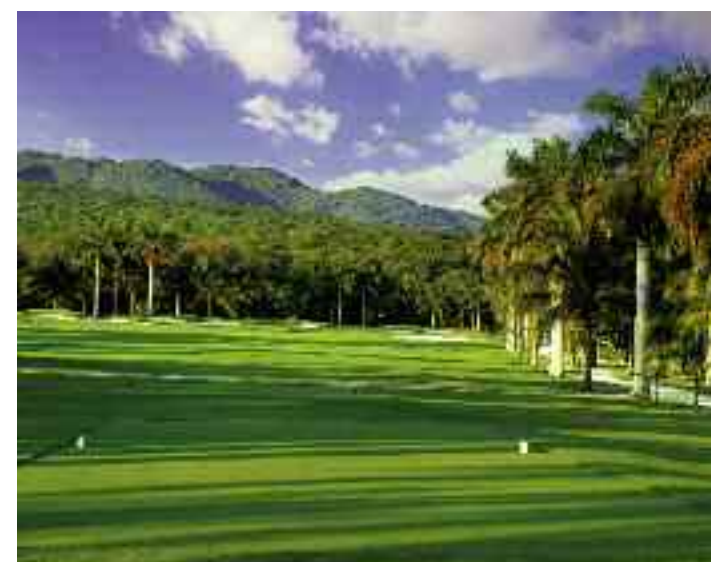
The par-4 15th hole at the 7,119-yard Half Moon Golf Course in Rose Hall, Montego Bay

Jamaica's Sandals Golf & Country Club awaits enthusiasts with a challenging 6,311-yard, par-71 course. The club is located 700 feet above sea level in Upton, surrounded by lush fauna just east of Ocho Rios. Rolling terrain and magnificent flowering and fruit trees dominate the 120-acre layout. Complimentary green fees are included for all Sandals Resorts guests in Jamaica, and round-trip transportation is provided from all Sandals Resorts within the Ocho Rios area. Club facilities include two practice areas, a putting green with chipping area, a driving range and qualified golf instruction by a resident PGA Golf Professional. One lesson a day is included for all Sandals Resorts guests who wish to learn the sport or just brush up on their swing.