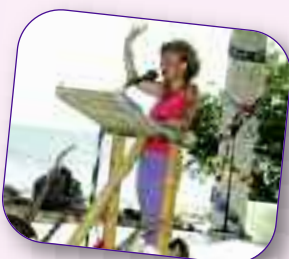
Calabash International Literary Festival

Calabash presents three days filled with readings and live music, all for free, at Treasure Beach. More than 30 authors and musicians from 10 countries will read and perform at the 7th Annual Calabash International Literary Festival, showcasing Jamaica's extraordinary literary strength. Visit www.calabashfestival.org .