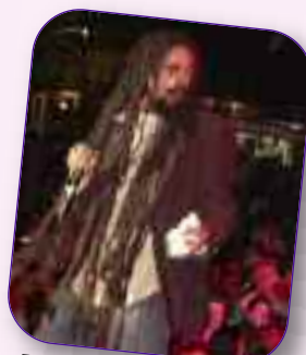
Damion Marley at the 2008 Reggae Sumfest

This hot annual music event features the top talent in roots, rock and reggae from all over the world. Past performers have included R&B queen Mary J. Blige, LL Cool J, Rihanna, 50-Cent and G-Unit, Missy Elliott, Morgan's Heritage, Elephant Man, Beenie Man and Bounty Killa, to name a just few. Visit www.reggaesumfest.com .