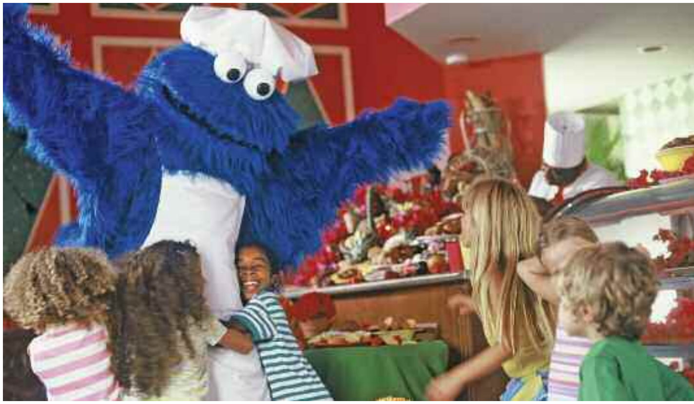
Beaches Resorts Caribbean Adventure with Sesame Street