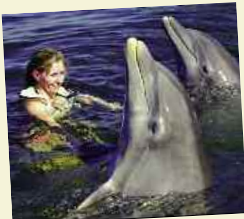
Dolphin Cove "Swim With Dolphins" Experience

THE PALMYRA RESORT & SPA , located on a pristine, white-sand beach within the elite enclave of Rose Hall, offers luxury living in beautiful, fully furnished suites, penthouses and villas, complemented by the extravagance of a 30,000-square-foot globally renowned ESPA. Set to open autumn 2008. Preview at www.thepalmyra.com .