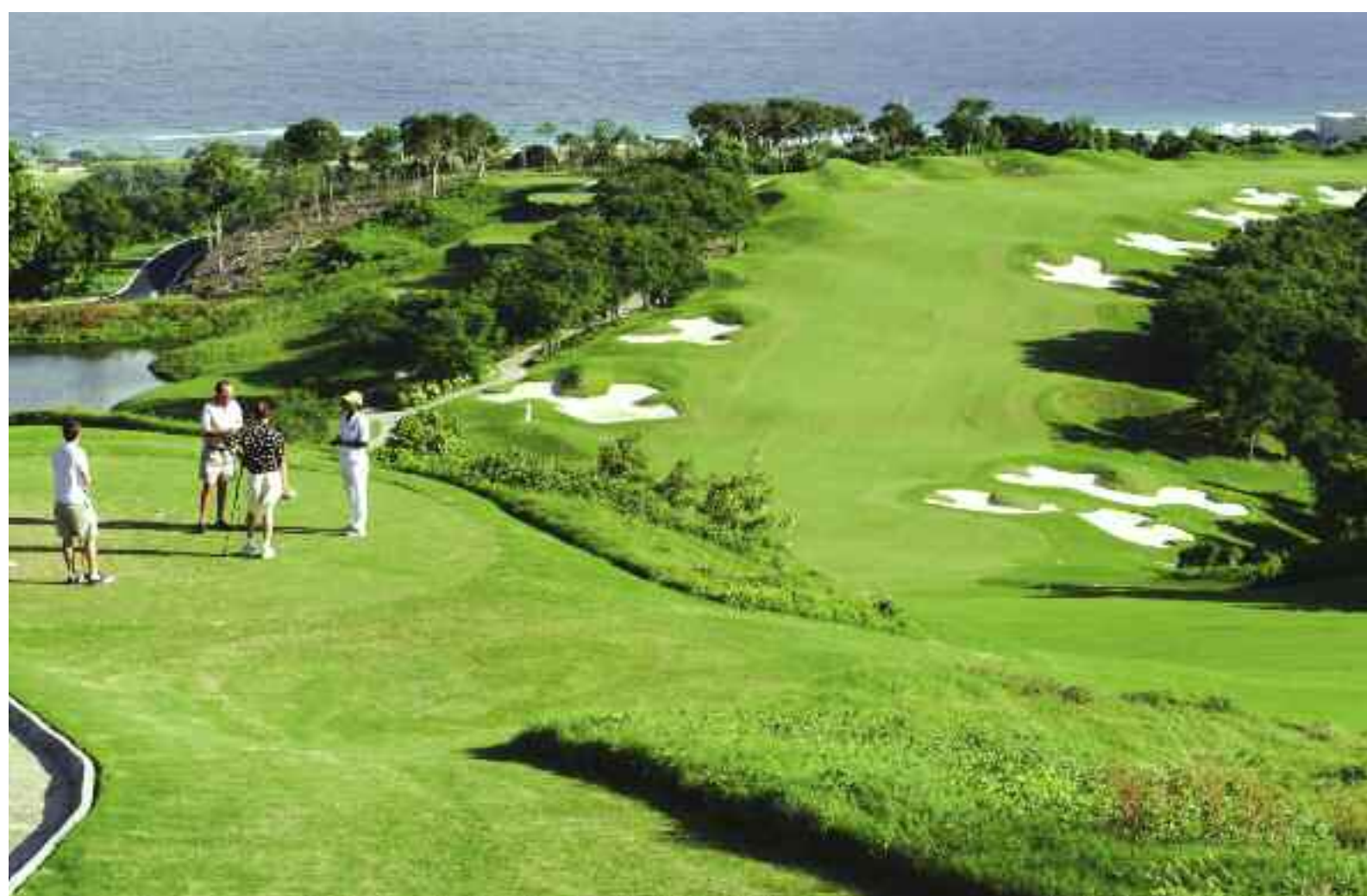
The daunting elevated #1 tee box at the challenging White Witch Golf Course in Rose Hall, Montego Bay