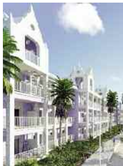
Artistic rendering of Riu Montego Bay Hotel, opening August 2008

Royal Plantation Private Villas. Visit www.royalplantation.com