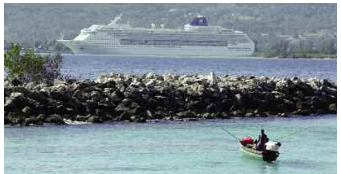
The Norwegian Sun docked in Montego Bay Cruise Ship Terminal

Prices are per person based on double occupancy. Valid for travel through June 30, 2008. All-inclusive includes all meals, beverages, taxes and tips. Airfare and round-trip transfers are not included. All rates and availability are subject to change without notice. Cannot be combined with other offers. Additional restrictions may apply. All applicable cancellation penalties apply. See www.iberostar.com for details. Iberostar does not assume responsibility for errors or omissions within the content of this advertisement.