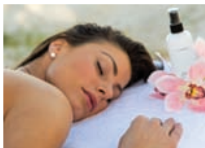
World-class spas make pampering a natural part of your holiday.

Caicos Cays, accessible via a gorgeous 35 minute sea journey from a private dock at Provo's Leeward Going Through. The main resort includes 45 rooms and suites, with four poster beds and private sun decks, while the 12 stand-alone beach villas include private pools and butlers. (Also available are large, privately owned homes for rent.) The cay, a pirate's hide-out in the early 1700s, is traced with sheer