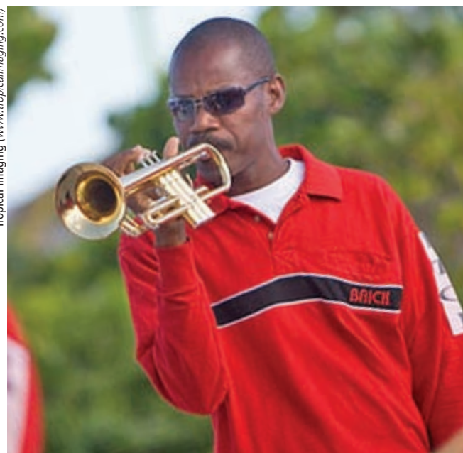
Be prepared for the rich sounds of local bands during the grand Maskanoo parades.

Tropical Imaging (www.tropicalimaging.com)