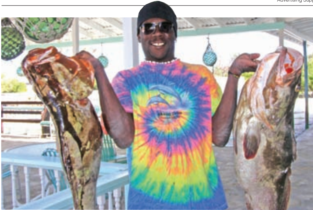
Yes, fishing is truly exciting in the TCI's bountiful waters, although not every catch may be this big!