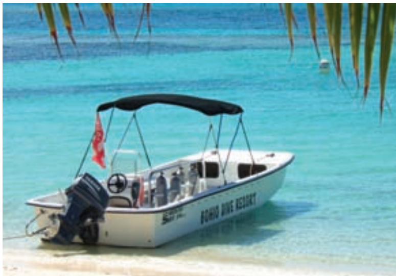
Grand Turk's pristine underwater walls are a very short boat ride from shore.

Stamp collectors never miss a stop at the Philatelic Bureau, as the Islands are known for their colorful and unusual issues.