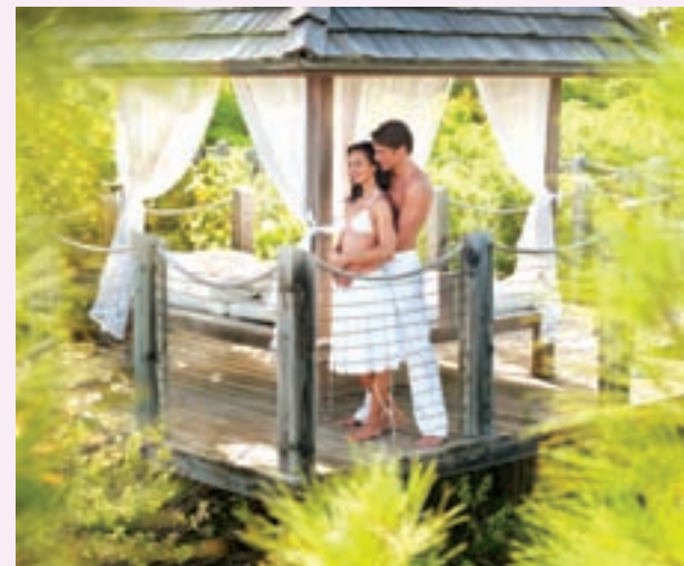
The Turks & Caicos offers dozens of beautiful and distinctive places to say "I do" . . . and enjoy the honeymoon afterwards.

Let the island trade-winds refresh your imagination. Why not have the bridal shower at one of the country's world-class spas, with a facial or nail treatment for each guest?