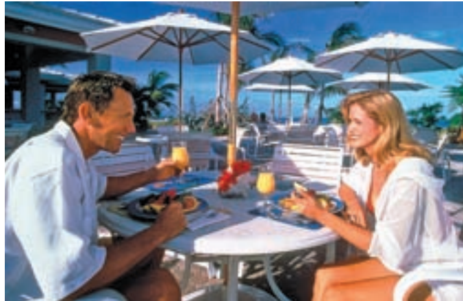
You'll be pleased at the variety and sophistication of Turks & Caicos dining choices and venues.

TCI dining serves a gastronomic surprise