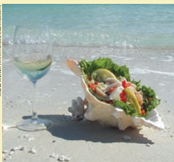
The annual TCI Conch Festival celebrates the country's #1 (and most tasty!) export.

Yes, there is edible meat inside those pearly pink shells. Conch has been a staple protein source in the Turks & Caicos Islands since the days of the Lucayan Indians. Local fishermen continue to harvest conch from the surrounding waters and it remains the country's number one export. Providenciales is home to the world's first commercial conch farm and on Grand Turk, visitors to Conch World can learn more about the tasty mollusk.