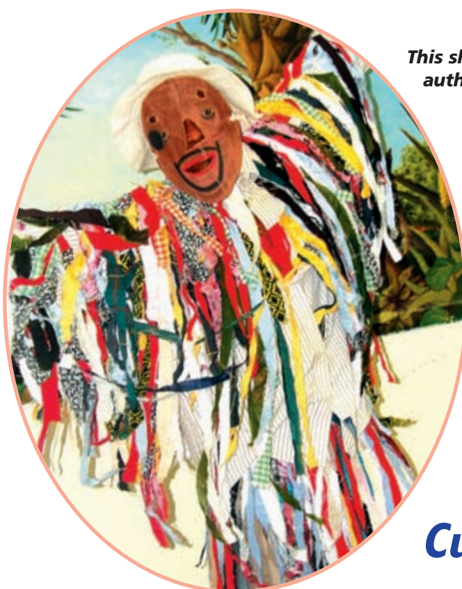
This shaggy costume and mask reflect the authentic tradition of TCI's "massin" celebration.

For more information, visit www.conchfestival.com .