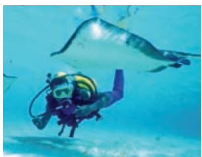
At Gibb's Cay, divers can swim with friendly manta rays.

Snorkeling and scuba diving in the Islands' calm, clear waters are especially popular. There are easily accessible snorkeling sites