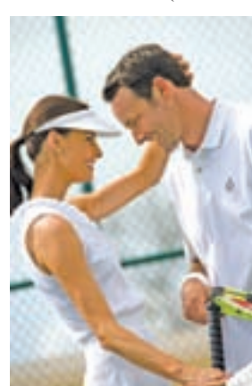
Many T&C resorts have tennis courts.

best spots and it won't be long before you're pulling in hungry snapper, grouper, yellowfin and other browsers. Bonefishing on the expansive flats of the Caicos Banks (from Providenciales to