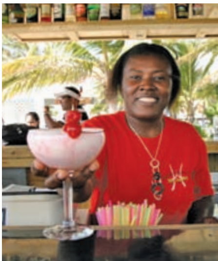
Sample frosty local cocktails at the Maskanoo festivities.

For more information, visit the official site of the Turks & Caicos Tourist Board ( www.turksandcaicostourism.com ).