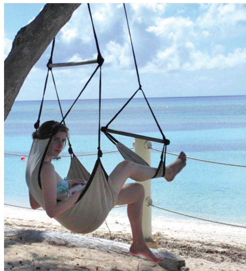
From a seaside hammock, contemplate the ever-changing colors of TCI's lovely ocean.

when guests can receive their fifth night free or get two nights free with a seven-night stay. (This offer is available all through November.) In addition, guests will get free passes to the Turks & Caicos Conch Festival on November 27. In December (through the 20th), the offer extends to a free night after just three paid nights, along with a seventh night free. Bonus travel rewards include daily Euro-